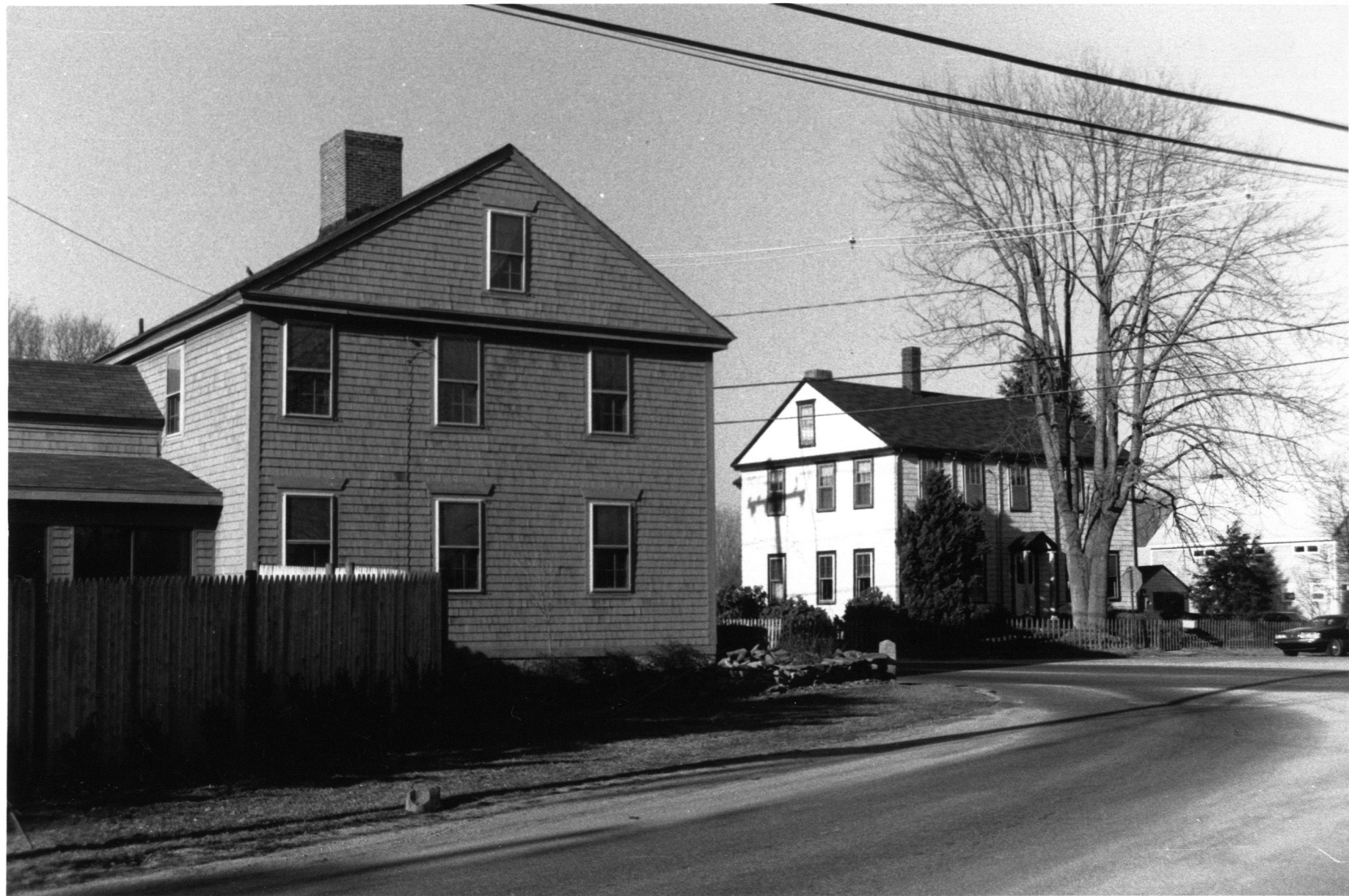
Luther House (near) - Maple Avenue + Old Warren Road. Luther Tavern (far) - 159 Old Warren Road. March 1988. Northeast view. SWN.B