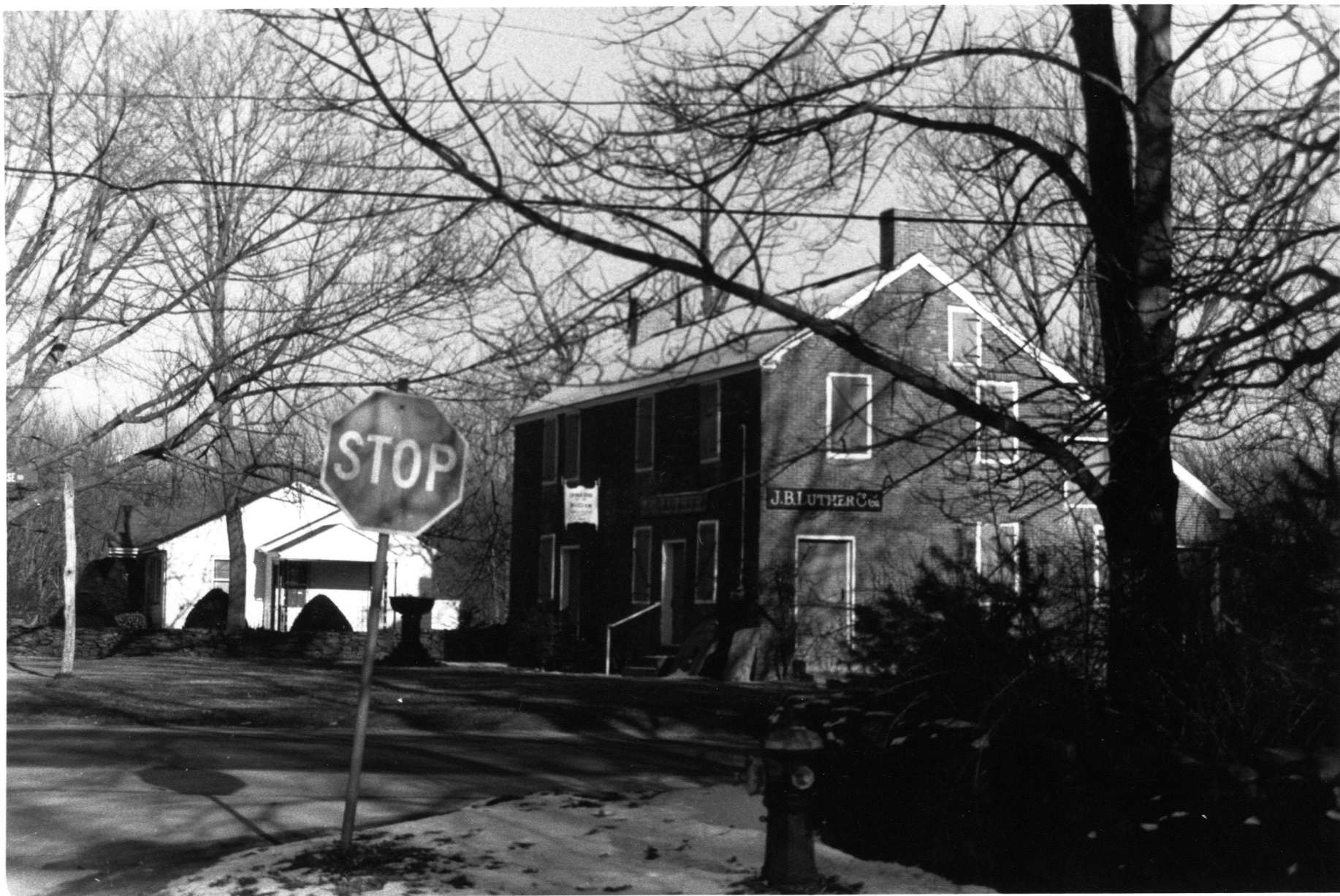
Luther Store, Old Warren Rd. + Maple Ave, SW Corner. March 1988. Southeast view. SWN.B