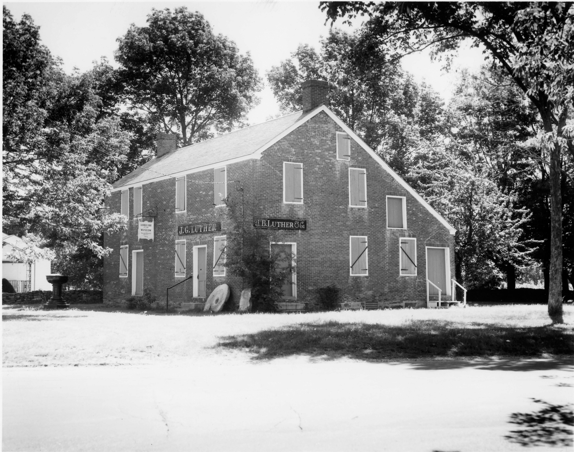
1. Looking northeast towards the facade and west elevation of the Luther Store. (Photo: Albert Deston, 1977)