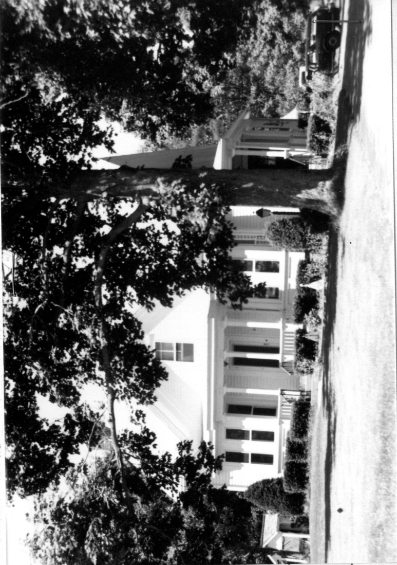
between inventoried property and nearest intersection(s). Indicate north