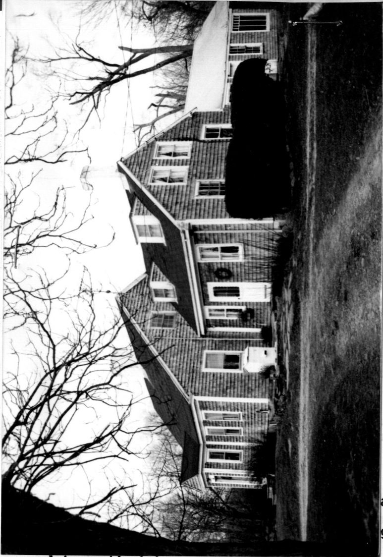
intersection(s). Indicate north