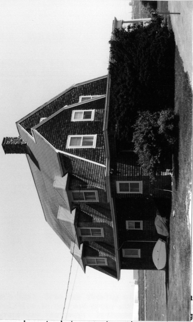
between inventoried property and nearest intersection(s). Indicate north