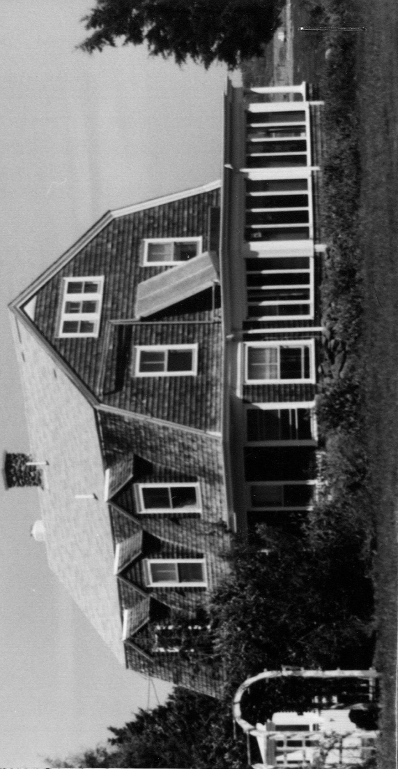
between inventoried property and nearest intersection(s). Indicate north