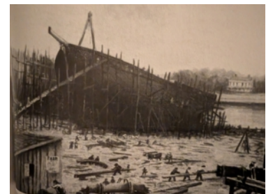
Mason Barney Shipyard on the banks of the Palmer River

From 1799 through 1859, 222 ships were launched from the Mason Barney Shipyard.